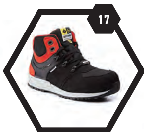
TO WORK FOR ESD & ANTI-FATIGUE