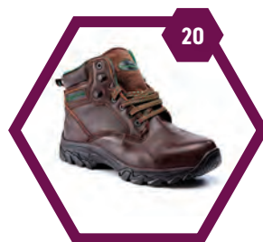
RUGGED TERRAIN, LADY TERRAIN & SPORT TERRAIN DISCONTINUED STOCK