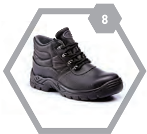
RUGGED TERRAIN BASICS