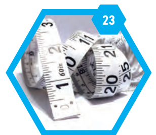
BELMONT SAFETY CODES & SIZING