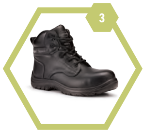
RUGGED TERRAIN & SPORT TERRAIN METAL-FREE & VEGAN