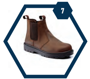
RUGGED TERRAIN INDUSTRIAL