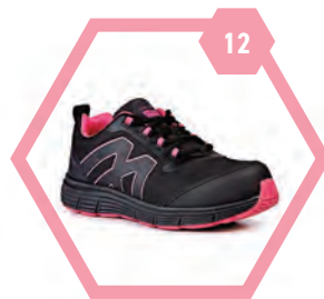
LADY TERRAIN LADIES