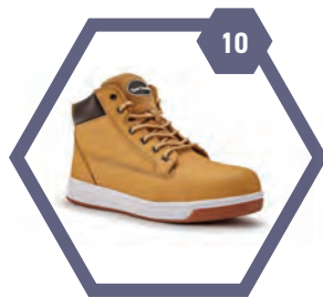
RUGGED TERRAIN & SPORT TERRAIN LEISURE