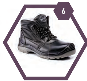
RUGGED TERRAIN S3