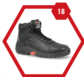
UPOWER SUPER GRIP