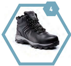
RUGGED TERRAIN WATERPROOF