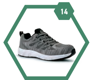
RUGGED TERRAIN & SPORT TERRAIN TRAINERS