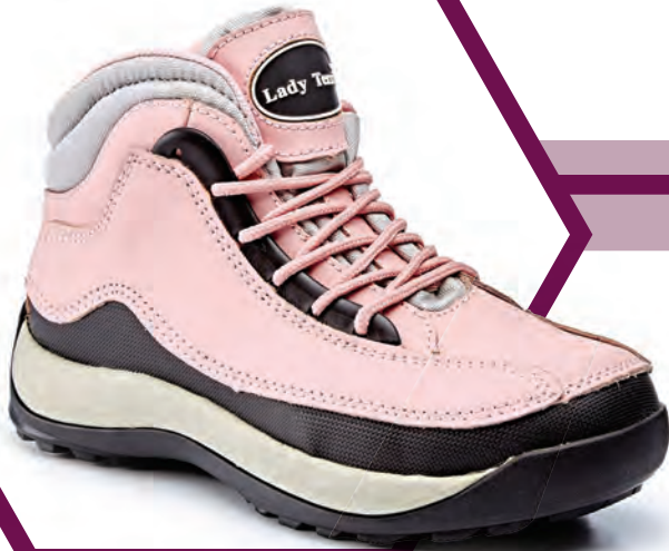
LADY TERRAIN PINK HIKER SB SRA