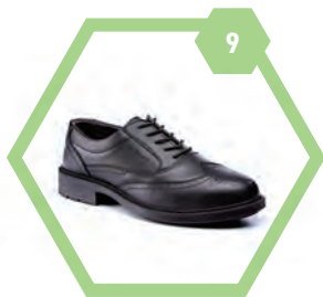
CITY TERRAIN EXECUTIVE FOOTWEAR