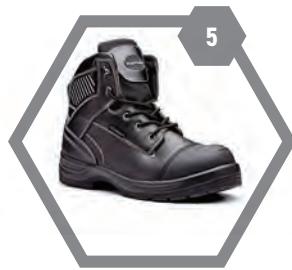
RUGGED TERRAIN ULTIMATE